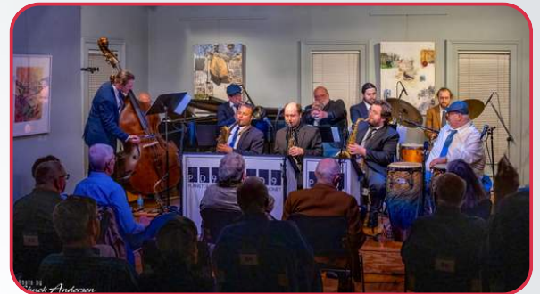
The Planet D-Nonet is a local, award winning 10 piece jazz ensemble